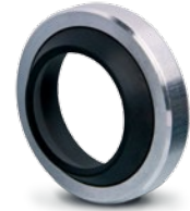
Wiper made of NBR with aluminum case