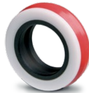
Compact piston seal made of NBR/POM