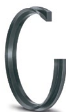
Merkel Enviromatic EA* Innovative deflector replacing V-rings in challenging applications