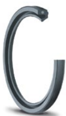
Merkel Radiamatic RPM 41 Radial shaft seal designed for work rolls in steel mills