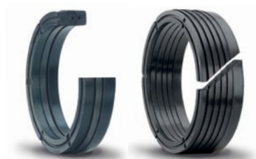
Merkel EK and ES Robust chevron sets designed for older cylinder systems