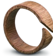
Piston guide ring made of resin-bonded fabric

For quick response, our Freudenberg Xpress facilities are located conveniently near you.