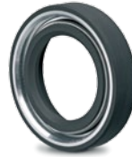
RMS Rapid Machined Simmerring

THE RIGHT SPIN: SIMMERRING OIL SEALS ALSO AVAILABLE Ordered. Machined. Delivered. The standard product program of Freudenberg Xpress has been expanded with the original Simmerring oil seal designs. All machined Simmerring oil seals are manufactured according to original drawings and materials.