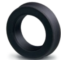
FX*-NI 150 elastomeric rod seal made of NBR