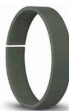
Merkel Guivex SBK and KBK as well as the SB and KB types – guides made of fabric-based laminate