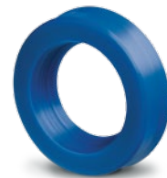
FX*-LF 300 low friction rod seal made of polyurethane

* FX: signifies machined standard product series