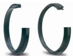
Merkel P 6* and P 9* Wipers with supporting elements respectively for additional sealing capability